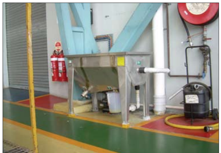
Knight 1000 Oil/Water separator's compact size fits neatly into any workshop.